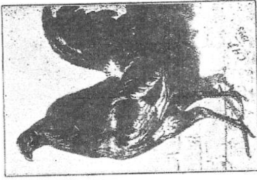
BELGIAN GAME. Flemish Game cock. The largest steel-fighting cock of the world.